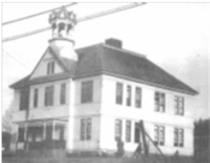
South Barre Schoolhouse